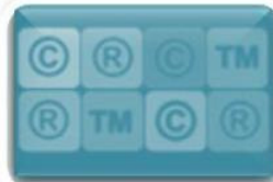
Intellectual Property Rights