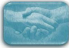
Arbitration Support & Dispute Resolution